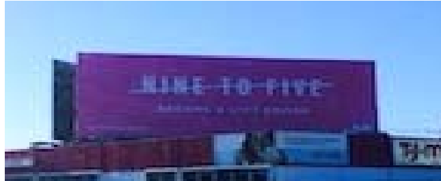
Image 1: On a billboard in San Francisco, Lyft advertises the potentials of flexible work: “ Nine to Five. ”

The ten-hour workday for taxi workers in San Francisco was accomplished through union representation. With unbridled competition, in order for a TNC driver or taxi worker in San Francisco to make a living wage in the post-union economy, he or she must work for longer.